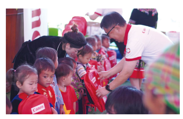
Donating school supplies to the newly opened school in Vietnam

Disaster Recovery Efforts (Tohoku Region)