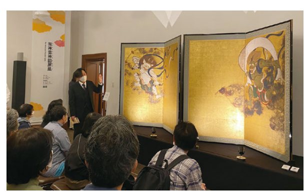
Artworks on tour (from the exhibition at Fukushima City Museum of Photography)

Moreover, in 2023, we held special exhibits in various venues displaying high-resolution facsimiles of artwork created by the Tsuzuri Project, drawing around 40,000 visitors. The Fukushima City Museum of Photography exhibited the facsimiles of five national treasures and also conducted projection mapping to project the worldview of the artworks. At Canon Gallery S in Tokyo, we held a special exhibit using popular artworks to convey the diverse beauty of Japanese art. Also, at Kenninji Temple, the oldest Zen temple in Kyoto, we exhibited high-resolution facsimiles of 19 masterpieces from the collection of the Smithsonian's National Museum of Asian Art, offering a distinctive viewing experience within the temple space. By utilizing facsimiles, all the venues allowed visitors to leisurely appreciate the exhibits without glass cases, providing a valuable and close encounter with Japanese cultural assets.