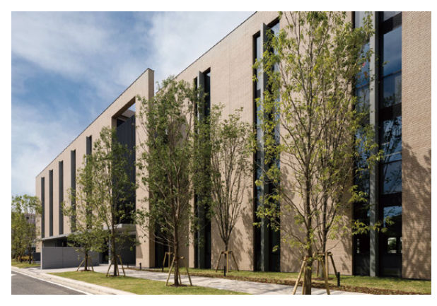
Based in Tokyo, the CIST develops software engineers

Elsewhere, we have sent 6 people to the "Top SE (system engineer) course" programs hosted by the National Institute of Informatics; and 3 people to the "Smart SE course" business school program organized by Japan's Waseda University that focuses on AI, IoT and Big Data technologies.