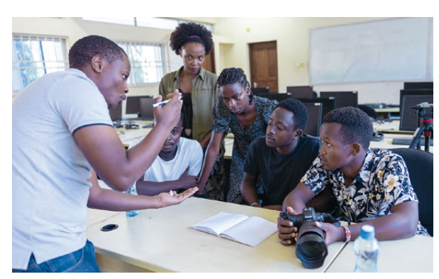
Miraisha students on a photography and film workshop in Mombasa, Kenya

In 2023, 300 people participated, bringing the total to 7,000 participants trained. Canon has also organized a training program to develop local photographers and videographers as Canon-accredited trainers for the Miraisha Programme. By 2023, a total of 25 Canon Certified Miraisha trainers were working throughout Africa, three of whom were recruited as Canon Group employees.