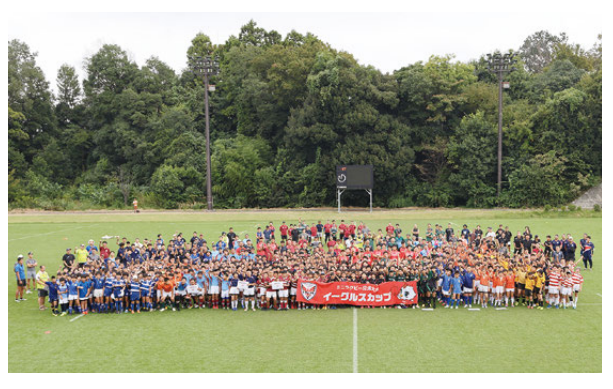
"Eagles Cup 2023" mini-rugby tournament

In 2023, the team held career education classes and tag rugby workshops at 25 elementary schools, with a total of 1,882 students participating. The team also hosted the "Eagles Cup 2023" mini-rugby tournament for rugby schools from the region at their training ground at Canon Sports Park in Tokyo.