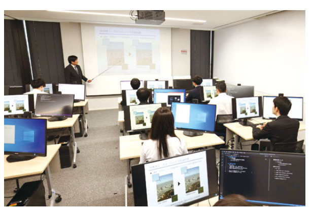
Software engineer training at CIST