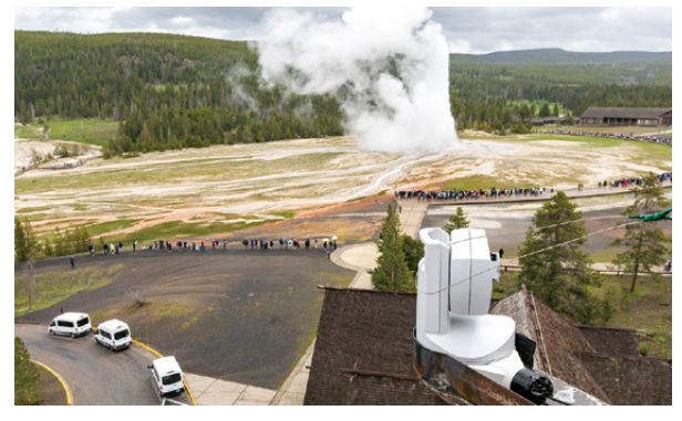
Live stream recording of Old Faithful using a Canon 4K remote camera

In 2023, Canon U.S.A., Inc. donated the 4K Outdoor PTZ Camera, which is installed opposite Old Faithful, so you can see a live stream of world-famous geyser Old Faithful.