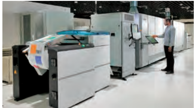
The ColorStream 8000 series of continuous-feed printers combines efficiency with high-quality printing

As for office and home printing, a reimagining of a print environment not restricted by working places is required to better suit the hybrid work styles combining office- and telework that were triggered by the spread of COVID-19.