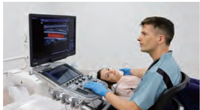
Canon's diagnostic ultrasound systems deliver high-definition images with less noise

India and Saudi Arabia last year, and we will strive to expand sales in these regions and elsewhere.