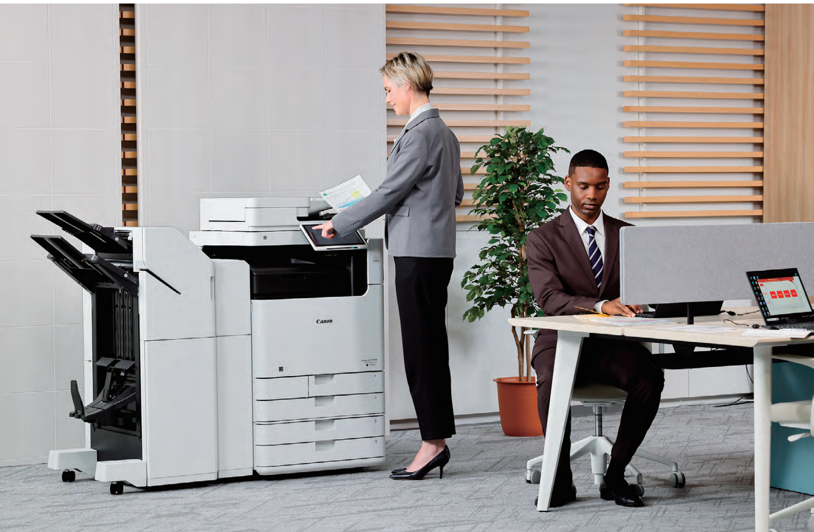
The imageRUNNER ADVANCE DX series enhances office productivity with high-speed, yet quiet, printing