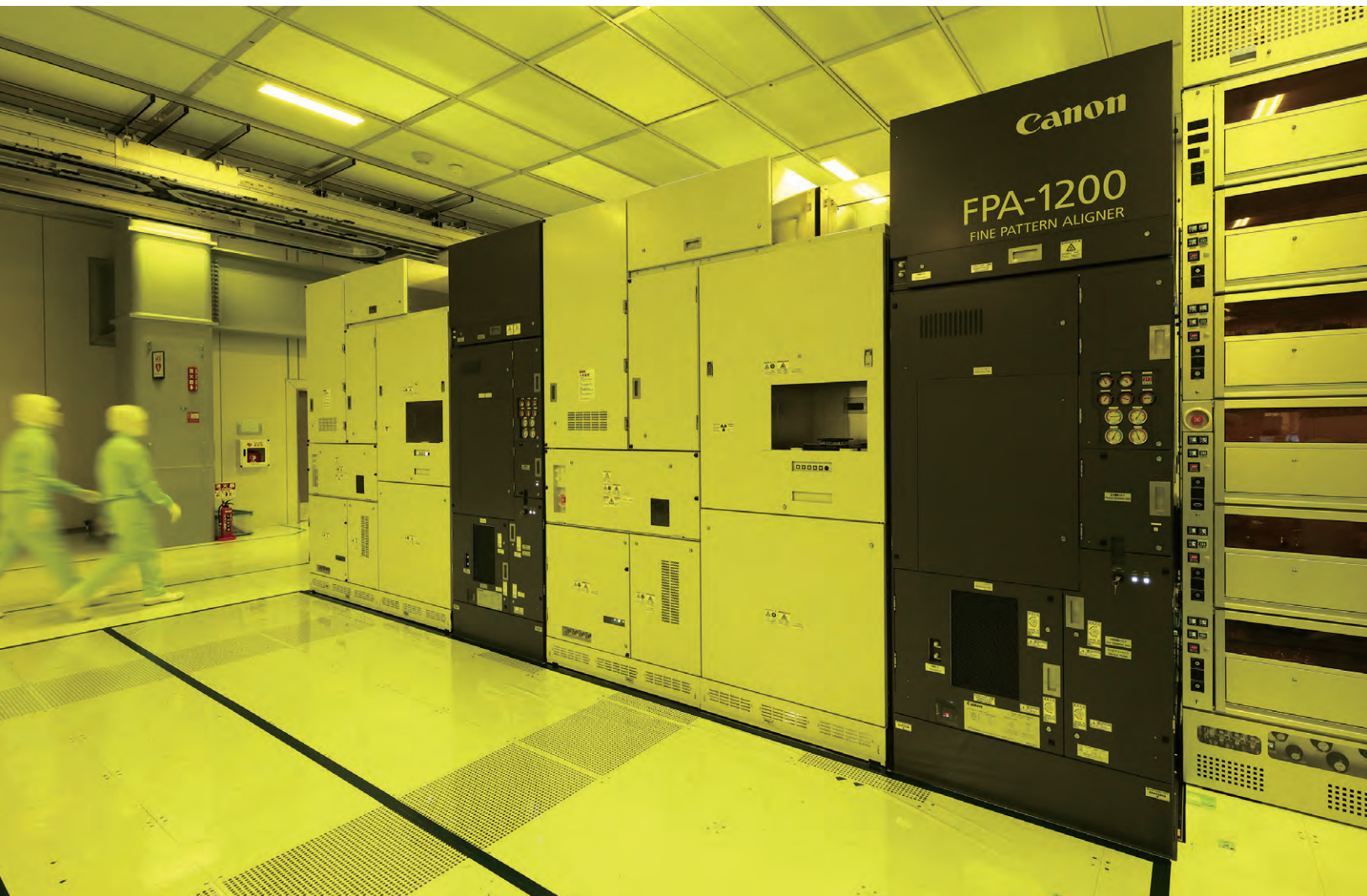
Nanoimprint lithography can significantly reduce manufacturing costs and power usage