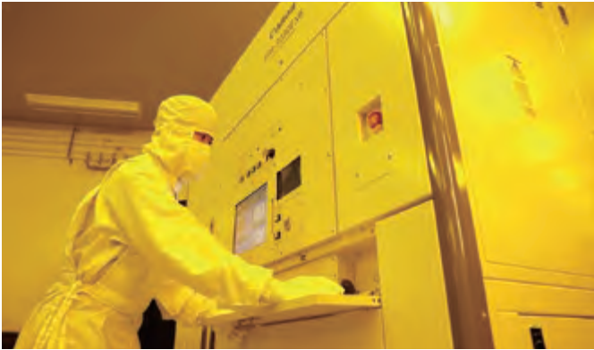
Semiconductor Lithography Equipment

The Industrial Group handles semiconductor and flat panel display (FPD) lithography equipment, as well as OLED panel manufacturing equipment and the like. This group is establishing a system for expanding production capacity to meet strong demand for semiconductor manufacturing systems and is reinforcing its global sales capabilities in an effort to further expand sales. For our semiconductor lithography equipment, we are constructing a new plant at our Utsunomiya Office (which is slated to come online in 2025), which will enable us to significantly scale up our production capacity. At the same time, we will make thoroughgoing efforts to keep costs down. In addition, we will build the business foundation for our groundbreaking nanoimprint lithography technology that