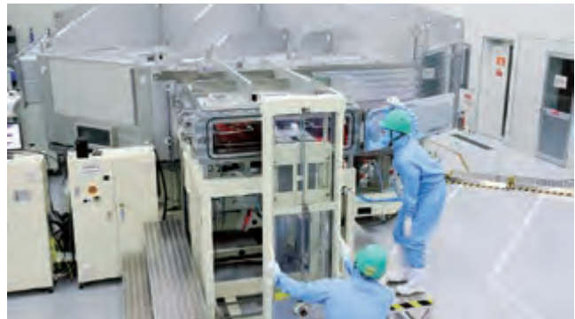
OLED display manufacturing equipment continues to be utilized in various ways