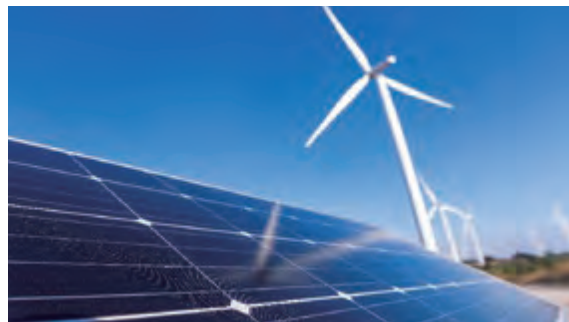
Images of Canon's high-performance materials that can be used in areas such as mobility and energy to improve performance