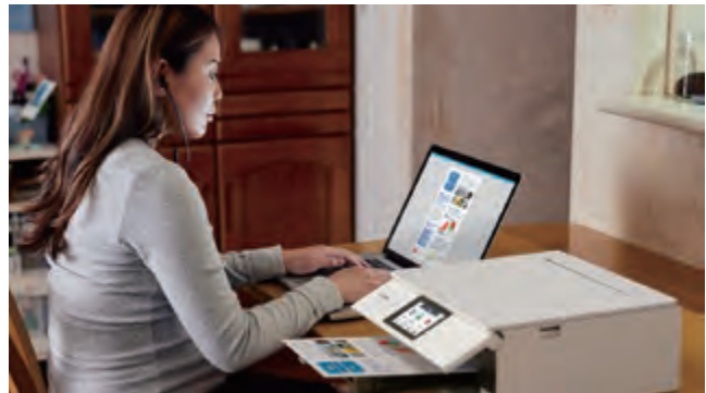
Canon’s inkjet printers meet broad-ranging demand for working or studying at home

The Company will provide optimal printing equipment for the place by leveraging its strength of having two digital printing technologies, namely electrophotography and inkjet, and offer new printing solutions in the DX era by connecting these devices utilizing the cloud.