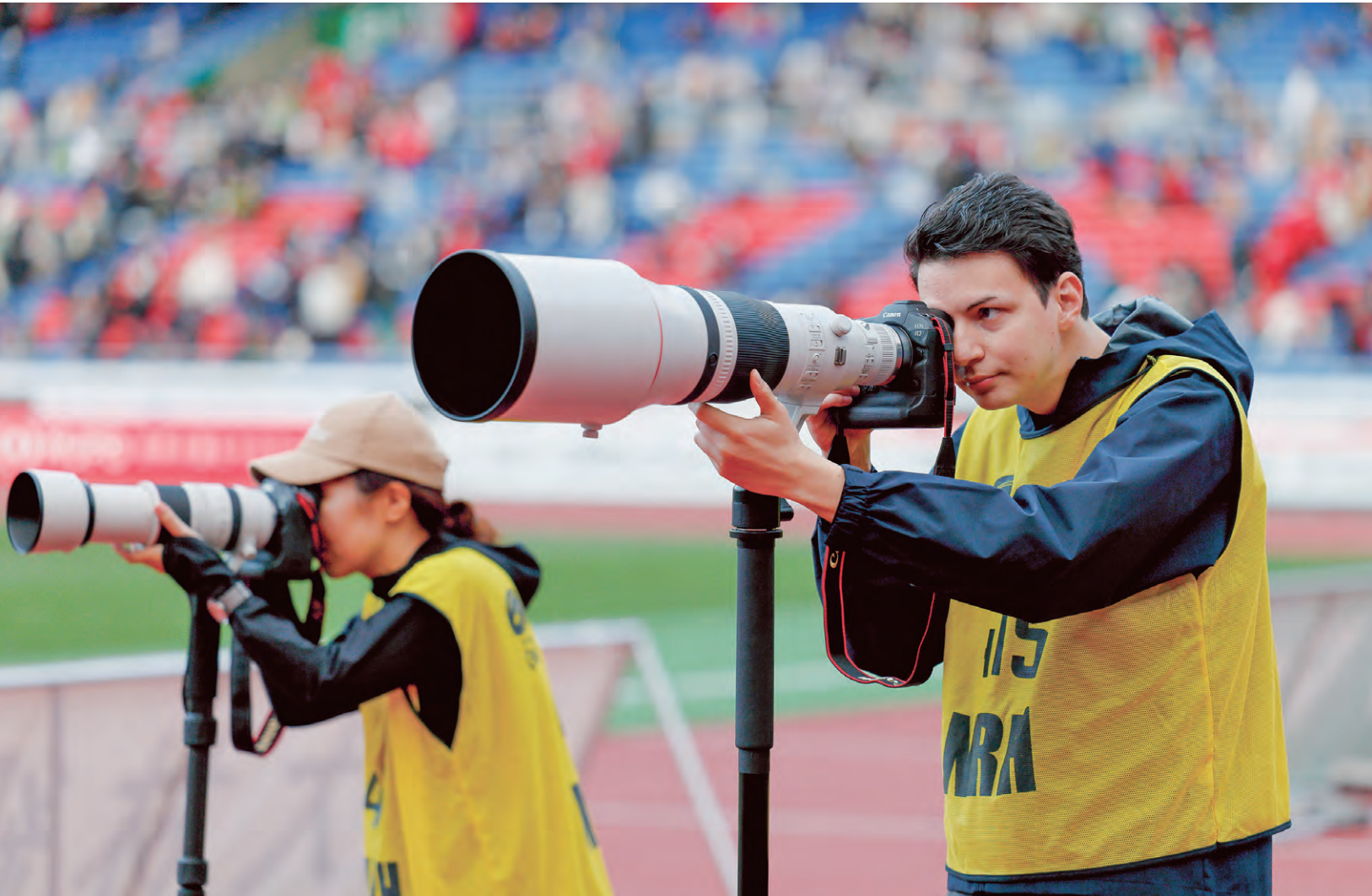
Canon's mirrorless cameras support shooting users with outstanding corrective functions and high-resolution