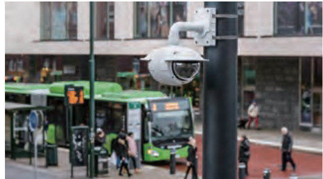
Canon’s high-precision network camera systems provide peace of mind and safety to communities