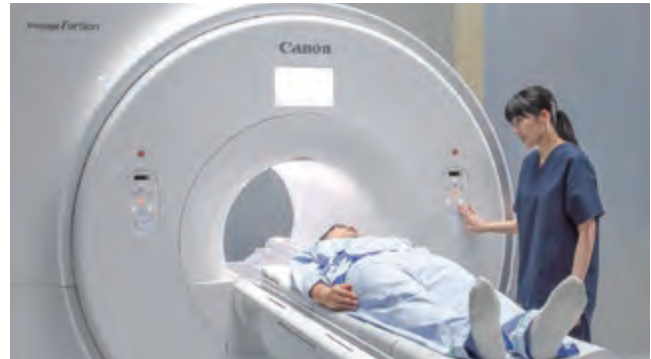
Canon's MRI systems use new workflow to deliver both quality and efficiency in examinations

In emerging countries, we established a local corporation in