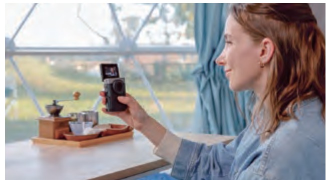
Canon’s compact and lightweight vlogging camera meets the various needs of users