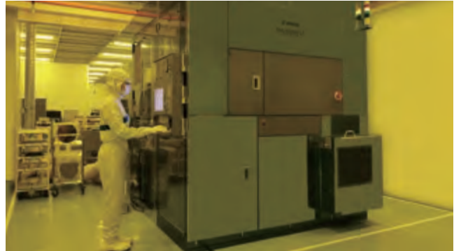
Demand for semiconductor lithography equipment is expected to grow stronger in the future

Furthermore, the Company aims for the early sale of “nano-imprint lithography,” a new system released last year to expand sales. Unlike conventional lithography technology that uses light to expose circuit patterns, this device, which forms circuit patterns by pressing a patterned mold like a stamp, has attracted inquiries from many manufacturers because it can significantly reduce production costs and power consumption. We will proceed with assessment and confirmation jointly with customers to realize practical applications starting with memory and expanding to other areas such as logic and even non-semiconductor devices, including meta-lens.