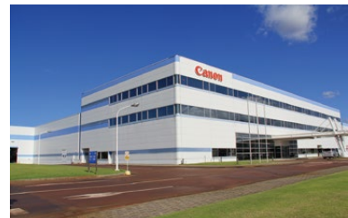
Canon Tokki Corporation