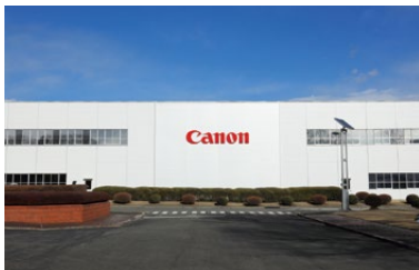
Canon Medical Systems Corporation

Reference: Canon Group Directory https://global.canon/en/corporate/information/group/