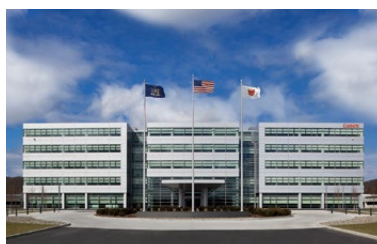
Canon U.S.A., Inc.