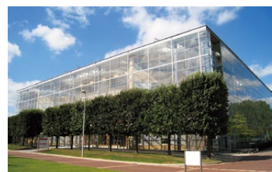
Canon Europe Ltd.