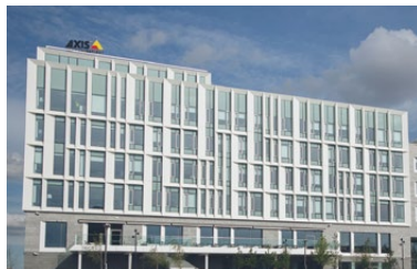
Axis Communications AB