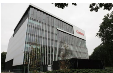
Canon Production Printing Netherlands B.V.